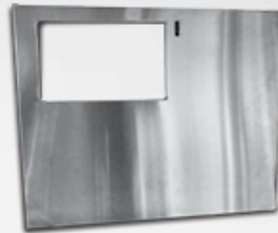
Water Heater Access Door