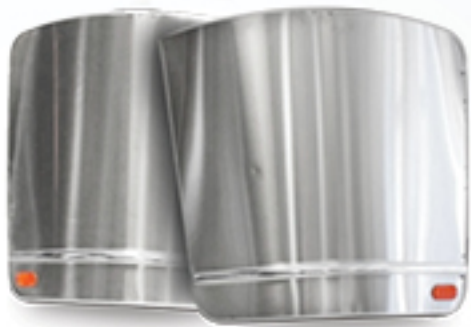
Lower Segment Protectors