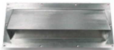
Range Exhaust Vent