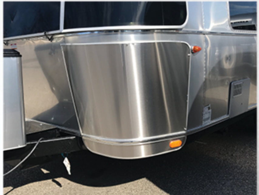
Lower Segment Protectors