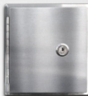
Water Fill Compartment